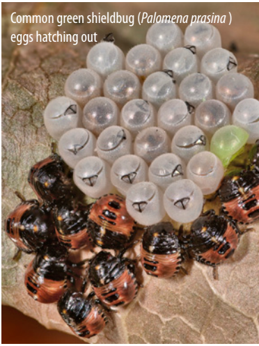
Common green shieldbug ( Palomena prasina ) eggs hatching out