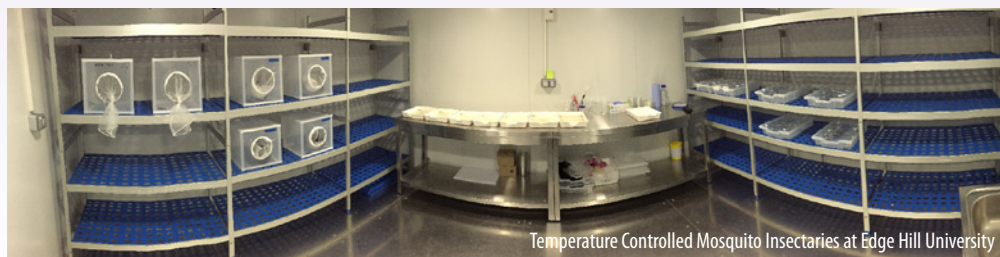
Temperature Controlled Mosquito Insectaries at Edge Hill University