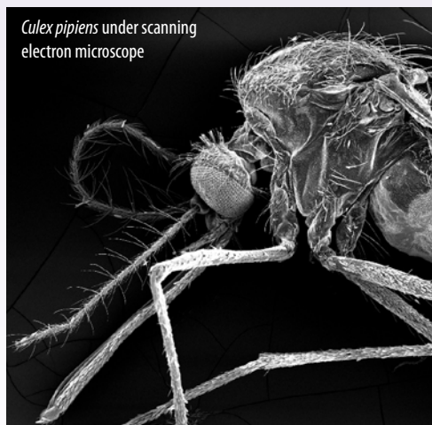
Culex pipiens under scanning electron microscope

The ugly will explore the challenges and difficulties of studying and conducting research on less charismatic species or the microfauna and discuss what we can learn from them.