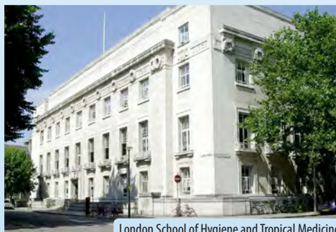
London School of Hygiene and Tropical Medicine