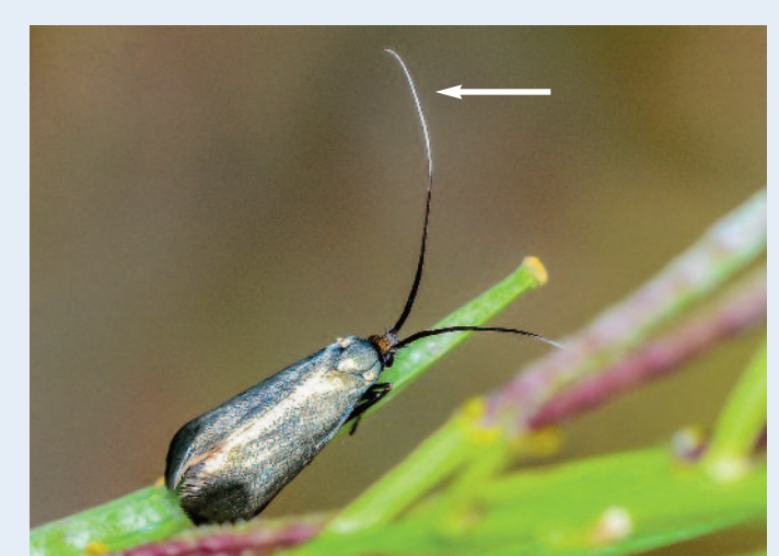
A small day-flying moth with very long antennae and bronze or metallic forewings. Found in woodland and gardens, sometimes in swarms of 20 or more individuals.