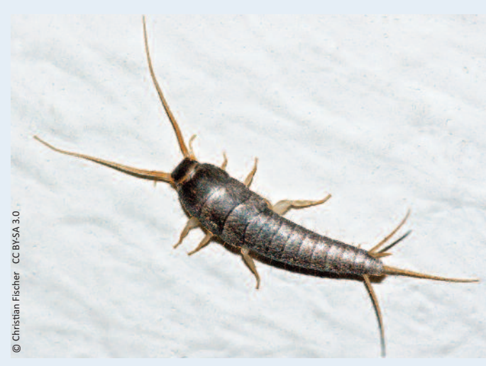
A harmless, flightless insect covered in silvery scales. Found in damp, humid areas such as leaf litter and in houses in kitchens and bathrooms.