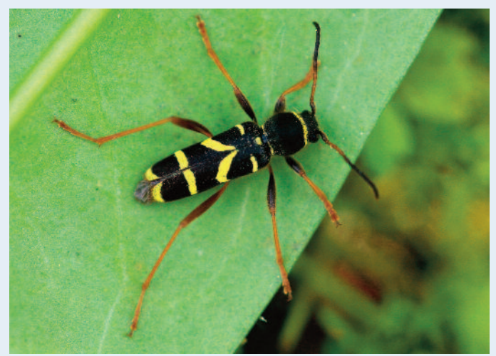
A harmless beetle that feeds on flowers. Its distinctive colours and stripes mimic a wasp, helping to give it protection from predators. Found in woodlands and hedgerows.