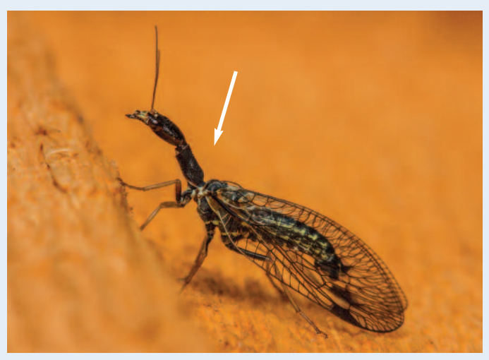
A long thin insect, with an elongated prothorax (neck) and long antennae. Stands with raised head in an s-shaped, snake-like pose. Found in woodland and gardens.