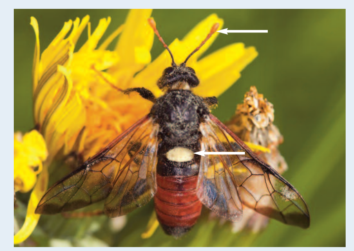
Has a distinctive pale band on the dark abdomen and antennae have yellow tips. Found in woodland and gardens with Birch trees.