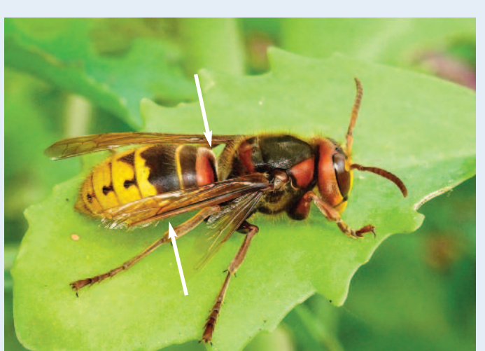
Body has an obvious waist and yellow and brown stripes. Less aggressive than the Common Wasp, a useful pollinator. Often seen in late summer feeding on fruit trees.