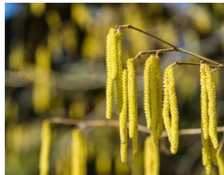
Common hazel ( Corylus avellana )

Supports a wide range of insects and its leaves provide food for moth caterpillars.