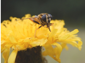
Common dandelion ( Taraxacum officinale )

Good nectar source for many flying insects such as lacewings, ladybirds and a larval food source for moths