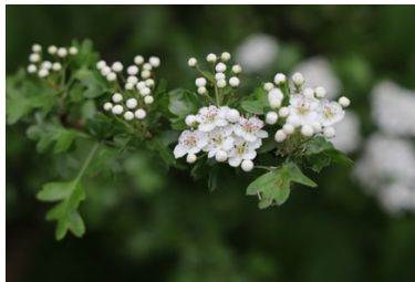
Hawthorn ( Crataegus monogyna )

Supports over 300 species of insect, in particular flies, including hoverflies, and small beetles.