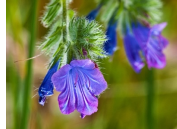
Viper's bugloss ( Echium vulgare )

Supports many insects including 20 species of butterfly, bees and hoverflies. Several rare insects only live on this plant.