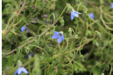
Pygmy borage ( Borago pygmaea )

Attracts a variety of pollinators, particularly bees. After a bee has visited a flower, it refills with nectar within two minutes.